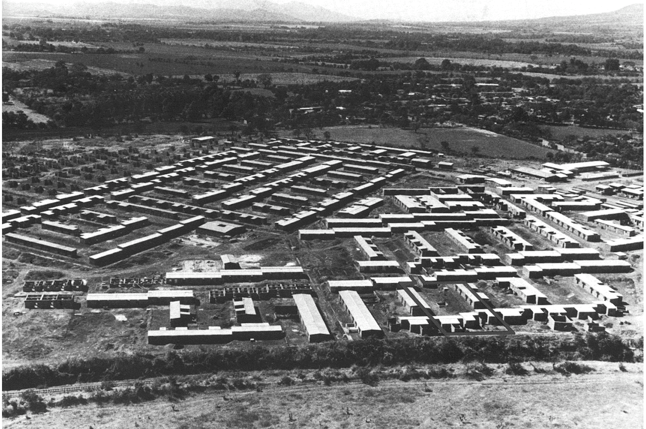
Aerial view during construction, ca. 1979. Note the clustering of units around a shared open space.