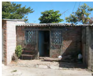
Early stage of development