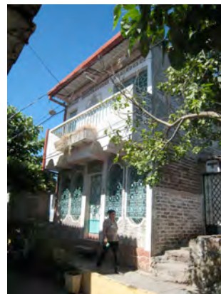
Successful multi-story expansion