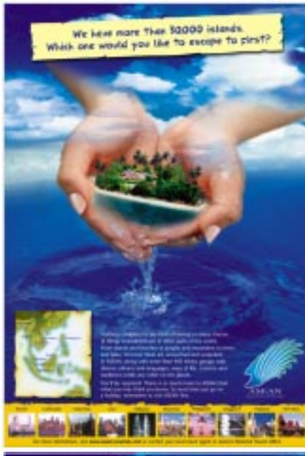
Land-locked Laos has no islands for tourists.

involved in future land use planning for Vientiane. Interestingly, one recent five-year plan designated Harddonechan Island as an area for “preservation of green space and nature”. VUDAA’s responsibilities are more administrative and include issuing building permits and managing infrastructure maintenance. I believe these organizations are truly motivated by a desire to make planning decisions that have the best interests of Vientiane’s residents in mind. However, their authority is trumped by any decision made at a higher level of government. Both the Urban Research Institute and VUDAA claimed that they were not involved in the hotel project, and indeed did not seem aware of any details concerning it.