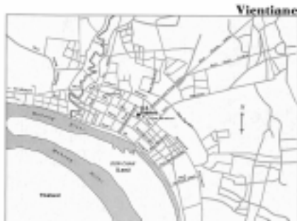
Harddonechan (or "Don Chan") Island in the middle of the Mekong.

Information about the hotel project was gathered primarily through a series of interviews conducted in early January 2004 in Vientiane as part of the Massachusetts Institute of Technology's annual Special Interest Group in Urban Settlement (SIGUS) workshop. Interviews and meetings were held with local residents including the village chief, three Lao government agencies, a French NGO, and the general manager for the development. All research was conducted as a team consisting of members from the Massachusetts Institute of Technology (Cambridge, USA), the National University of Laos (Vientiane, Lao PDR), and Oxford-Brookes University (Oxford, UK). Resident interviews were conducted in Lao and translated for the non Lao-speaking members of my team.