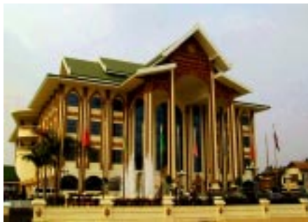
Imagine this roofline on top of a 14-story hotel.