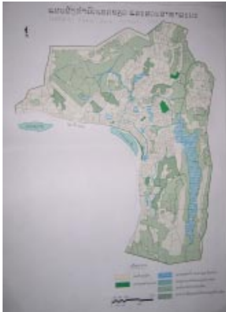
Vientiane Comprehensive Land Use Plan

Several parties have a stake in the outcome of the project including the Lao government, the Malaysian government, the developer, the Vientiane planning authorities, and the residents of Harddonechan Island. The top-level of the Lao government along with the investor hold nearly exclusive control over the project, while the Vientiane planning authorities and local residents are passively affected. Finally, it is worth considering the target market for the project, the tourists themselves.