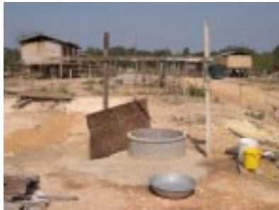
The resettlement village near the airport.

resettlement or compensation issues related to the hotel construction. Despite our efforts, no government official was able (or willing?) to give us any information on the exact amount of compensation residents would receive if they were displaced.